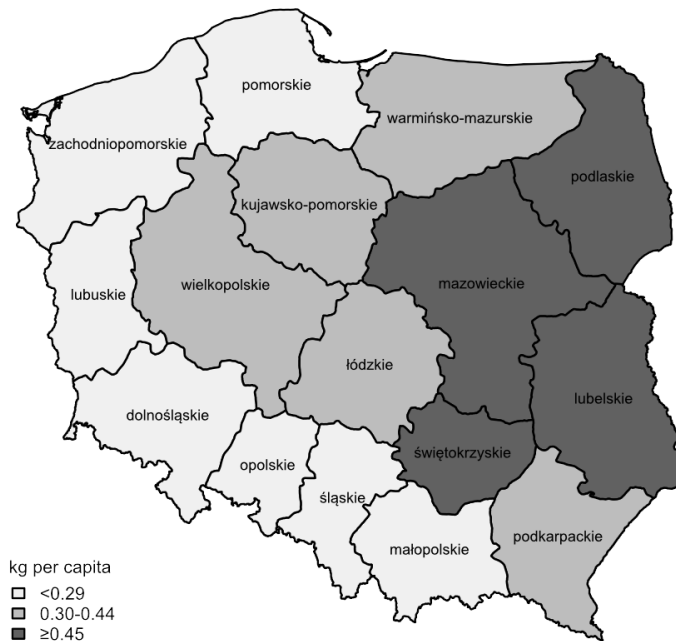
Fig. 2. Consumption of asbestos in terms of kg per capita, by provinces

The Fig. 2 above showing the quantity of asbestos products used for construction of buildings in the individual provinces of Poland, expressed in terms of 1 kg asbestos per 1 inhabitant, reflects the health hazard from emission of asbestos dust to the atmospheric air as a result of degradation of those products, including mainly roof tile and wall panels. Three zones are clearly visible. The greatest quantity of asbestos-cement products had been used for construction purposes in the provinces forming so-called the Eastern Wall: Podlaskie, Lubelskie, Mazowieckie and Świętokrzyskie.